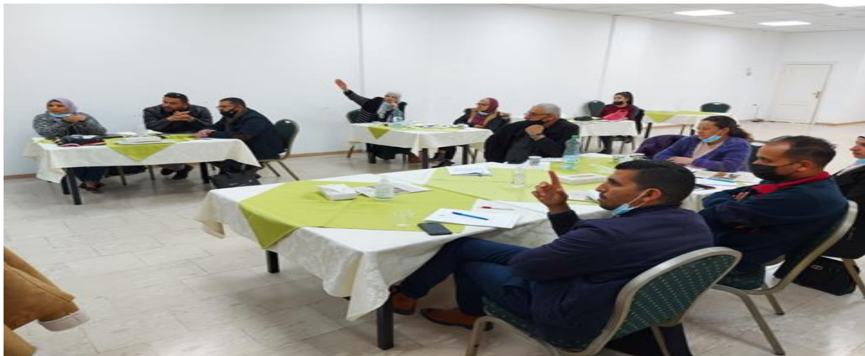
Picture 10. Training of partner organizations (POs) on Evidenced Based Advocacy (May 2022)

Also, within the project, psychosocial assistance was provided to women exposed to GBV via free helplines and case management by a team of counselors in five different areas (Ramallah, Nablus, Jenin, Tulkarem, and Hebron) with 432 consultations and 443 counseling sessions to 214 cases conducted, and a total of 763 women were reached on professional legal aid services to GBV victims in three areas (Ramallah, Tulkarem, and Nablus). In addition, an analytical report of GBV cases handled during the project was published. The report discussed in details selected cases as related to type of violence, the success achieved and the challenges face the counseling and the recommendations to tackle it.