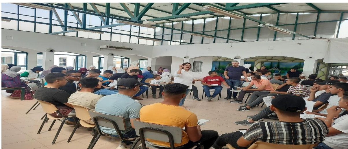
Picture 11. An awareness workshop on youth's life skills, Nablus, Nablus Governorate, October 2022.

Through the GBV program, PWWSD contributed to the annual 16 days campaign to Combating Violence Against Women, by implementing activities within the program projects. The activities ranged from conducting awareness sessions, organizing trip for GBV women survivors to talk about their experiences, participating in media (TV and radio, social media) programs on GBV issues, and embarking in advocacy activities toward the duty bearers, particularly on the “Family Protection Law” and on the National Referral System.