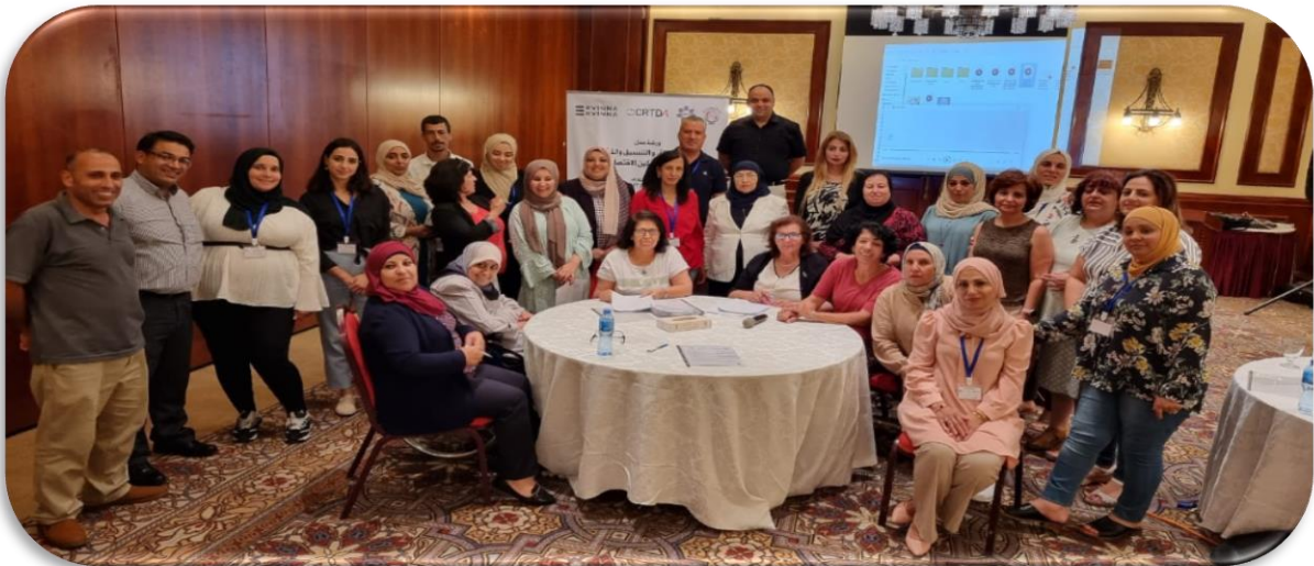
Picture 8. Signing the agreements with a total of 11 Partners Organizations (POs) within Fem-Pawer Project (Economic Empowerment Program, Jericho July 2022).

During the year 2022, the main focus of Fem-PAWER was on building capacities of the POs after receiving the grants, through conducting capacity development, networking opportunities and to initiate lobby and advocacy campaigns. These activities started after the POs underwent self-assessment, to identify the assets and areas for improvement in the field of lobbying and advocacy for E-GBV, and to identify organizational capacity of the POs in the field of governance, finance management, program management, networking as well as their strengths and areas for improvement.