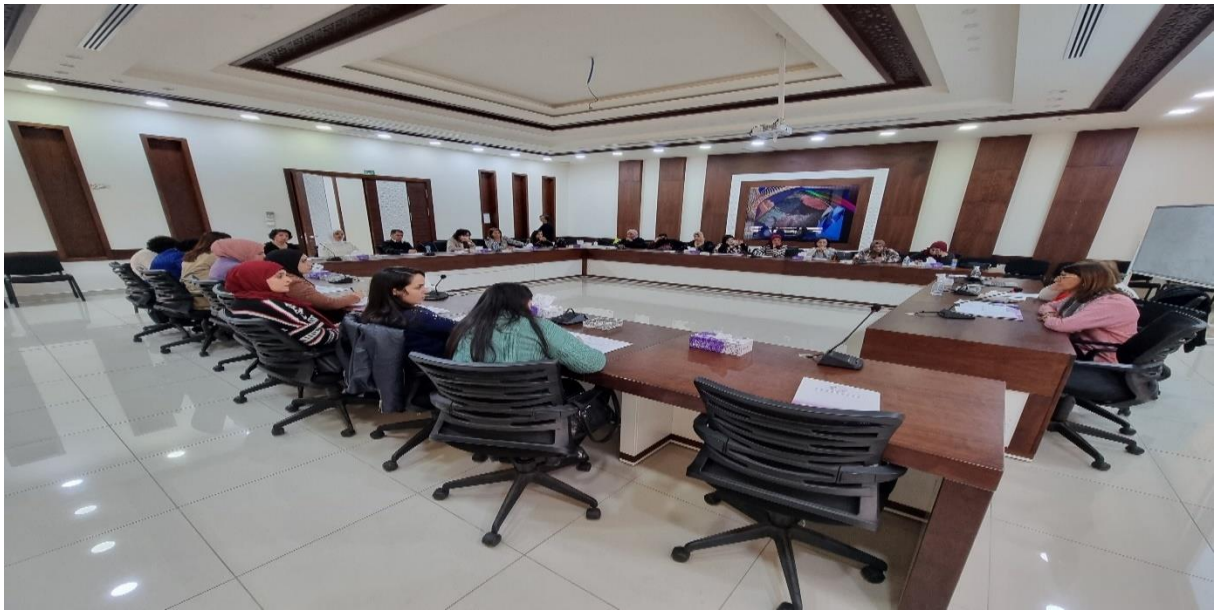
Picture 13: session entitled: Women with Palestinian Identity Married in the Negev Between the Hammer of Laws and the Oaks of Society

Hammer of Laws and the Oaks of Society” . Among the recommendations resulted from of the session was to conduct community awareness against marriage of young girls and against multi-wife marriage in “Negev”, to Increase the coordination with the counseling department in the Sharia courts, to provide information on rights of the married women in Negev, to advise women not to marry already married men who having Israeli ID, and to demand to modify/change laws and regulations for the fair treatment of women married to men who carry Israeli ID.