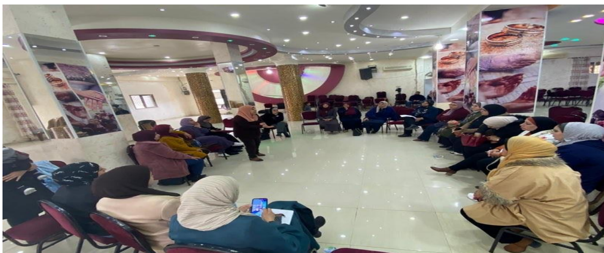
Picture 6. The first initiative; an exchange of experiences visit held in Deir Al-Asal's village council hall, with the participation of women member of local councils from the middle and south of the WB (Hebron, 7 December, 2022).

To support women participation in the second phase of the local elections (March 2022), as voters and as candidates, PWWSD in cooperation with the Palestinian Central Elections Committee implemented project, with focus on the needs of women candidates who lack the appropriate tools to recruit voters, as the traditional conservative community and political discourse and the existing patriarchal structures does not give women adequate space to express themselves and promote their role as decision- makers and that they have the capacity to serve the whole community.