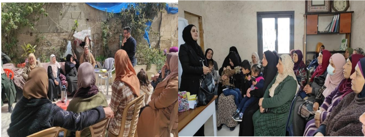
Picture 1. Examples of Workshops encouraging female engagement in the electoral process, specifically in smaller local councils (Hebron and Bethlehem Governates), March 2022.

report related to the implementation of CEDAW convention and in the women's movement in monitoring its implementation by the government.