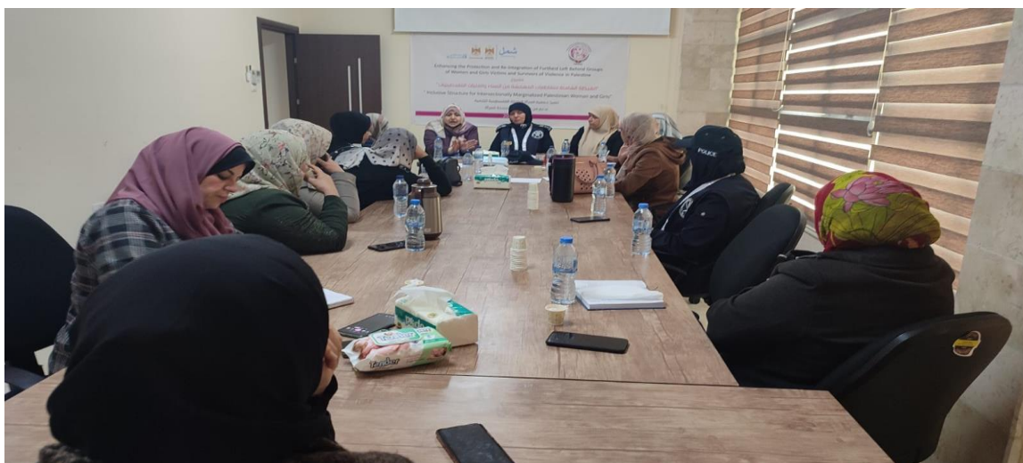
Picture 12. Hearing sessions organized with duty bearers, Gaza Strip, October 2022).

Furthermore, supportive groups were selected, formed, and empowered on psychosocial interventions, and coordination meetings with key service providers within the framework of the National Referral System were facilitated also, and hundreds of individuals (females, males) were empowered through community workshops.