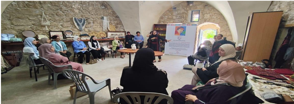
Picture 17. Women during awareness session, in Jenin. October, 2022

During 2022, help desk counselors conducted face-to-face awareness sessions through mobile info clinics, and a total of (24) awareness sessions were held on topics related to Gender-Based Violence (GBV) definition, forms, and physical and psychological impacts of GBV, identifying the police, women's protective institutions and social affairs available services, psychosocial health and wellbeing, and the protection mechanisms.