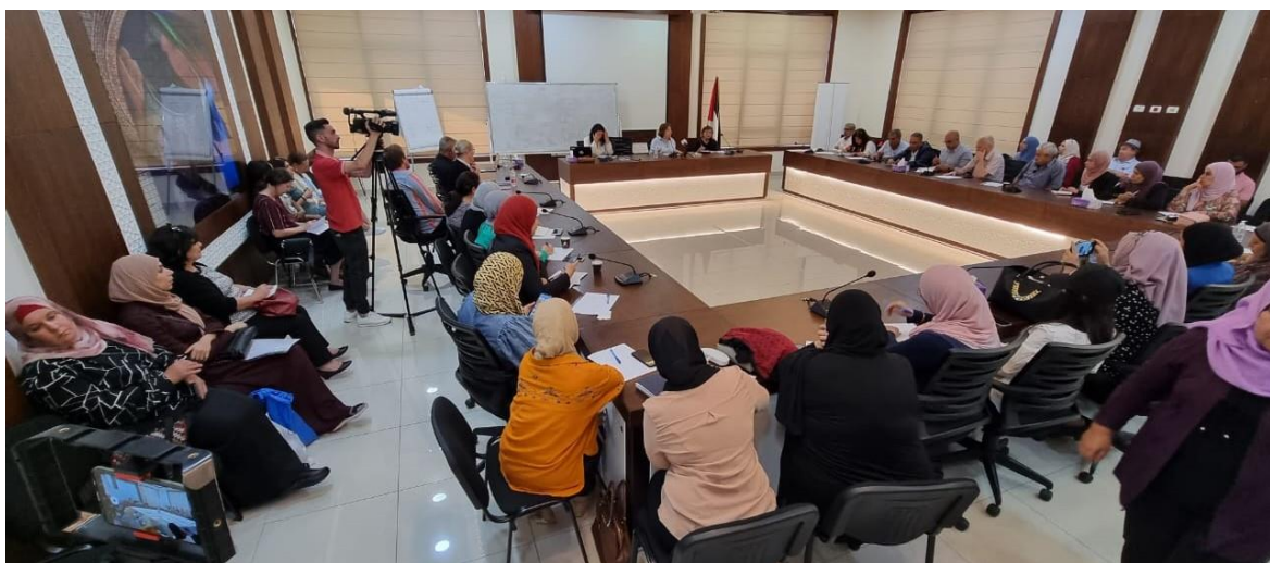
Picture 3. Advocacy meeting with leaders of political parties and community leaders on the role of political parties and democratic forces in promoting the political participation of women and youth" (September 2022).

Furthermore, advocacy meetings with political parties and community leaders were carried out in five locations in several governates in the West Bank, where hundreds of duty bearers and right holders participated.