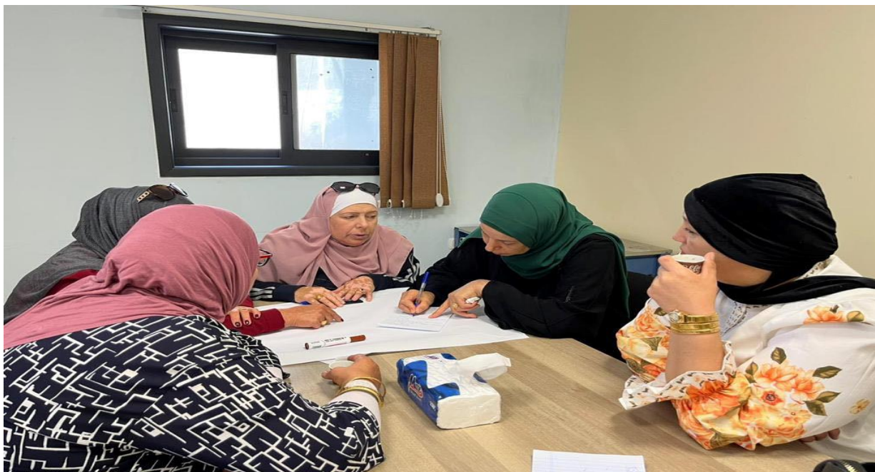
Picture 5. The first day of the training sessions on good governance, the role of women in local development and the laws of local authorities for elected female members in local councils (Ramallah, 1 October 2022).

In another intervention, members of shadow councils who were engaged in politics were used, through Positive Deviance (PD) and adaptive leadership methodologies and activation of community groups, in which women groups were formed and workshops were conducted in several locations in the West Bank and Gaza Strip. The focus was on presenting and sharing the positive experiences of the participating women with the aim of conveying the idea that women are capable of making change in their lives and in their communities and encouraging them to take steps towards political participation. A woman who participated in one of workshop was quoted as: