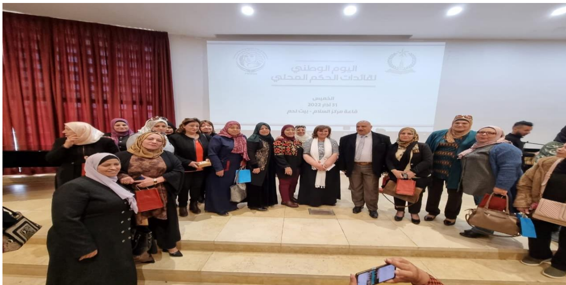
Picture 4. The national Day for “Leaders” in Local Governance, March 2022

In addition, the society and policy makers became more sensitized to women rights in the political life and more supportive, as decision makers who were reached out during the program, expressed changed views or positions through support women's issues in general, and their participation in the local elections in particular, whether as candidates or as voters, and PWWSD media including social media activities and posts reached hundreds of thousands of people in 2022.