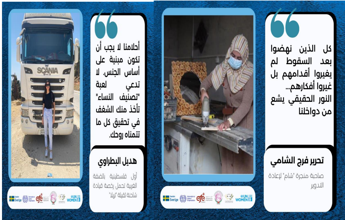
Picture 7. Examples of a Non-traditional job by Palestinian woman (Truck Driver and Carpenter), as highlighted by “Breaking the Discriminatory Norms” project.

In another regional project, PWWSD and partners engaged with young women who face multiple discrimination as a result of Economic-Gender-Based Violence (E-GBV) in the targeted countries. The project empowered women, to be the leader for change by holding duty bearers accountable and improve conditions for young women in the informal sector, through strengthening processes that contribute to creating an environment that promotes women economic rights (WER). The capacity building of women is reflected in strengthening inclusive leadership, mutual learning, building capacity in advocacy, and challenging existing social norms and gender inequality.