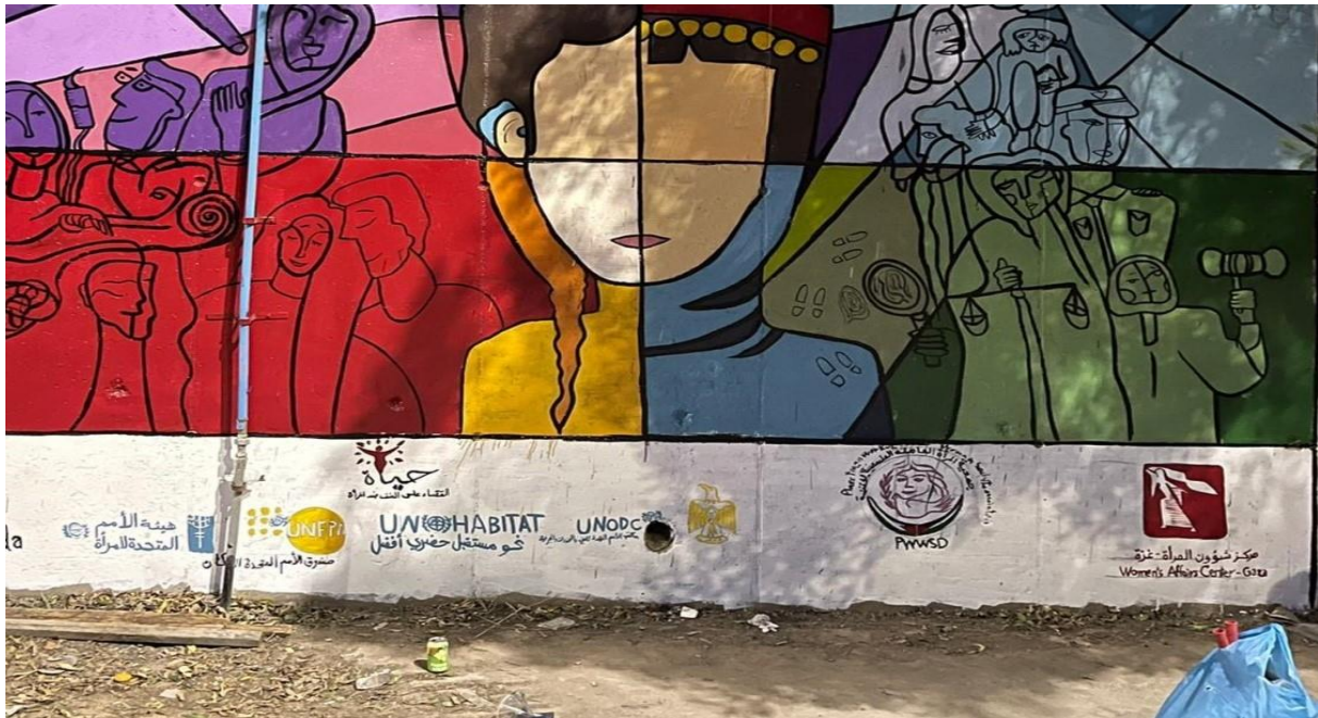
Picture 18. As part of Haya project, a Mural was installed in Jenin (December 2022)

Also, Women survivors “positive deviants” have engaged to express their feeling through safe area by 2 self-care days one in Jenin and other in Ramallah to increase their resilience and improve well-being, and the Forum for Women survivors of violence continued its activities in 2022, in which several meetings were held, with the participation of twenty attendees including women PDs. The Forum’s implemented activities toward reaching the following goals: (a) Presenting the services available by the national referral system service providers, (b) Concluding the achievements of the HAYA program, (c) Presenting women’s experiences and future suggestions as well as the challenges, and (d) Increased networking between women PDs across project areas.