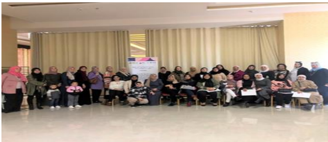
Picture 9. Example of activities conducted by one of the PO (ADWAR-Hebron) as part of FEM-PAWER Project. (November 2022).

During the year 2022, the main focus of Fem-PAWER was on building capacities of the POs after receiving the grants, through conducting capacity development, networking opportunities and to initiate lobby and advocacy campaigns. These activities started after the POs underwent self-assessment, to identify the assets and areas for improvement in the field of lobbying and advocacy for E-GBV, and to identify organizational capacity of the POs in the field of governance, finance management, program management, networking as well as their strengths and areas for improvement.