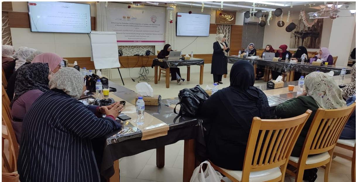
Picture 14: An example of Awareness session on protection and Re-integration of Furthest Left Behind Groups of Women and Girls Victims and Survivors of Violence in Palestine (October 2022).

service providers and women community leaders to present the outcomes of the results of the policy sessions and open dialogues on key recommendations and strategies for change, and a total of 12 messages were disseminated through social media from September–November about women left behind groups (elderly women with disabilities, girls' victims and survivors of violence and in conflict with the law, and women and girls who use drugs in Gaza).