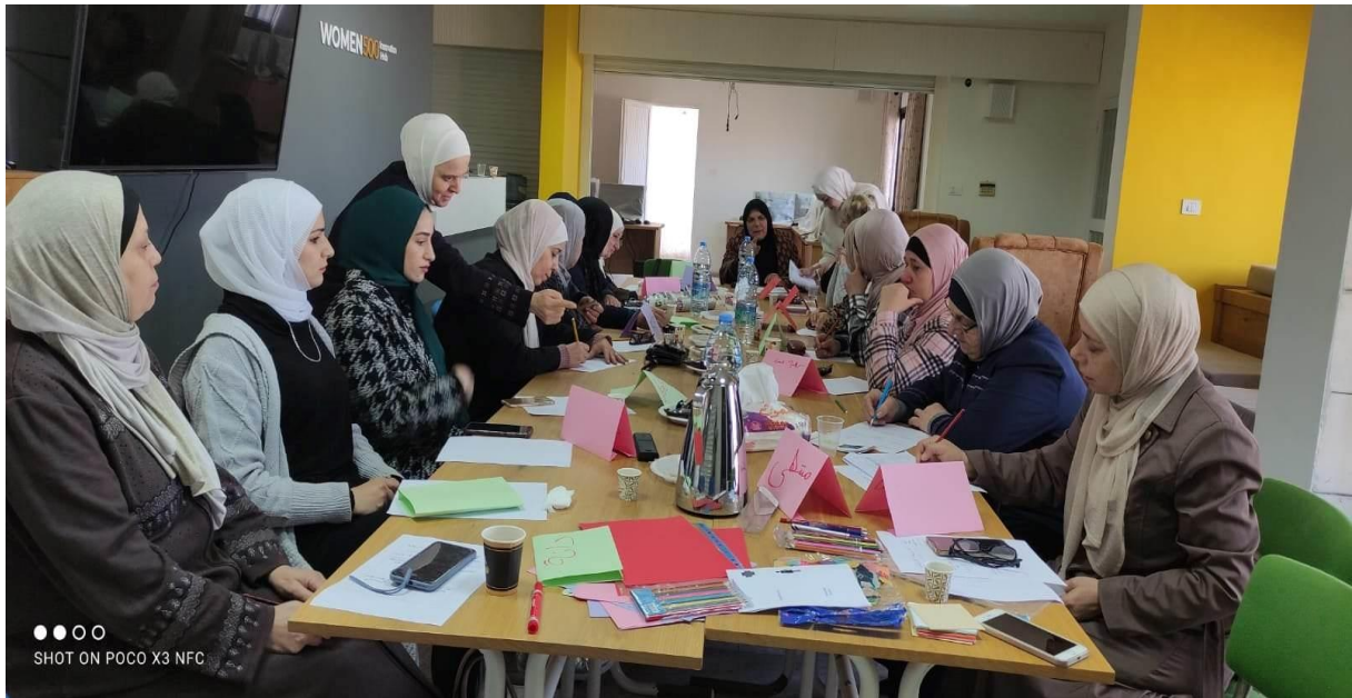
Picture 2. An awareness workshop on women's wellbeing, Nablus, Nablus Governorate, December 2022

Members of the shadow councils led all the hall meetings with the support of the PWWSD'S field educators, and presented the module of the shadow councils and its role in enhancing women political participation, and highlighted the importance of the support provided by political parties and local community to women's empowerment in Palestine.